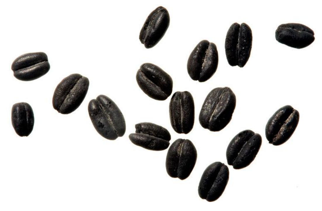
Figure 1: Charred wheat seeds

Archaeobotany is based on the identification, scientific analysis and interpretation of plant remains. These macrofossils are preserved by charring, waterlogging, mineralisation and desiccation. The latter tends not to apply to archaeobotanical assemblages in Ireland or the United Kingdom! In my experience, much of the material in this part of the world is charred – in particular that retrieved from prehistoric sites, although waterlogged material is also quite common. Charring is the result of the plant remains becoming carbonised under oxygen-poor conditions as a result of their interaction with fire; this leaves behind carbon skeletons of the seeds (Moffett 2009, 41).