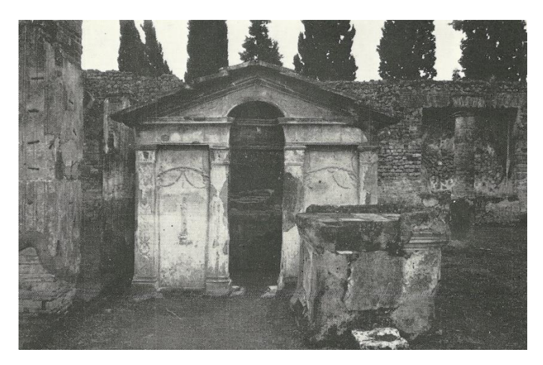
Figure 2. The Pompeiian Nilometer (after Wild 1981, Plate V.2).

Egyptians for its rarity (Wild 1981, 64), replaced Nile water in Iseums outside of Egypt (Wild 1981, 65). Just as the Nile flood assured Egypt's agricultural survival, the ritual "flood" in the Nilometer symbolized the abundant life-giving waters for agriculture in the Bay of Naples (Arney 2011, 56). In addition to the ceremonial flood recreation, the collected rainwater was used in other ritual practices. Priests manually removed this water, collected in a drainless basin (Wild 1981, 47). They then carried it in a sacred cultic pitcher, an important image in the later cult and in paintings on the temple's walls (Wild 1981, 44, 101), and used it for libation rituals, including the morning unveiling of the cultic image (Apuleius 1975, 93). At its core, the Isis cult at Pompeii celebrated its deity of life-giving waters through their collection in the Nilometer and use in sacred rituals.