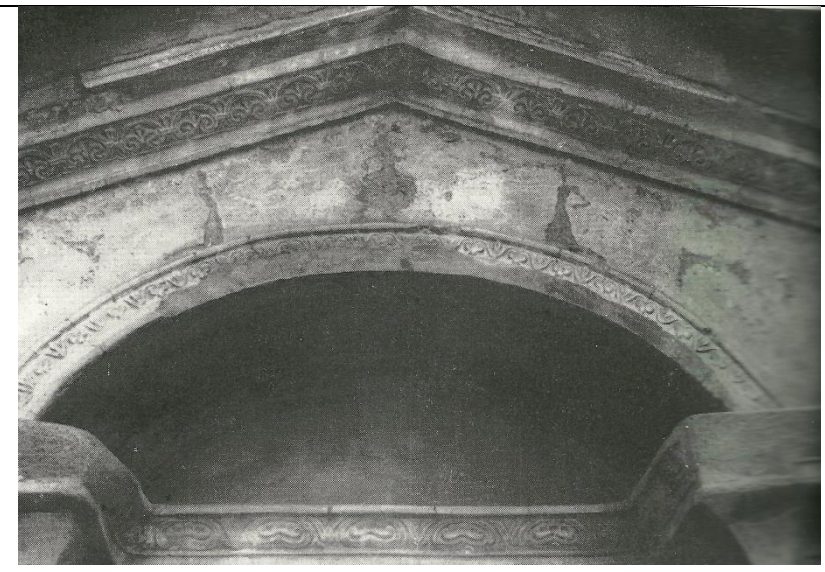
Figure 3. Detail of the Pompeiian Nilometer's exterior: the sacred pitcher (Wild 1981, Plate VI.1)

The connections made between Egyptian and Roman mythology suggest an intentional link between the two cultures and their mythology, which provides a foundation for the comparison between Isis and Neptune.