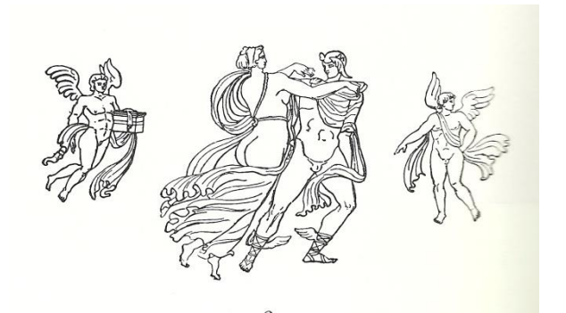
Figure 4. Drawing of Perseus and Andromeda, based on the painting found on the Pompeiian Nilometer (Wild 1981, Plate VI.1)

The connections made between Egyptian and Roman mythology suggest an intentional link between the two cultures and their mythology, which provides a foundation for the comparison between Isis and Neptune.