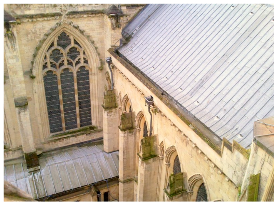
North Choir Aisle outbuilding in the angle between the North and East transept

The focus of recording, undertaken by Kate Giles and Alex Holton, lay in the basement of ancillary buildings situated in the angle between the North Choir Aisle and East Wall of the North transept. The entrance to the basement lies in Chapter House Yard (where numerous Minster restoration projects have taken place such as roof lead casting). In the basement there were a series of hints as to the North Choir Aisle and possible vestries' architectural development from the 13th century onwards. Of the extensive evidence lying within, this article will focus upon the three sections recorded by Kate Giles, Alex Holton and myself.