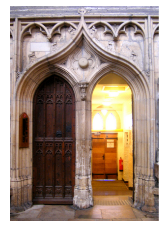
North Choir Aisle Door

Choir Aisle Shop Store where the north face of the west end of the chapel is preserved (Giles & Holton). On the west end of the elevation is a massive vault springer, yet there is no evidence for vault ribs or scars associated with removal.