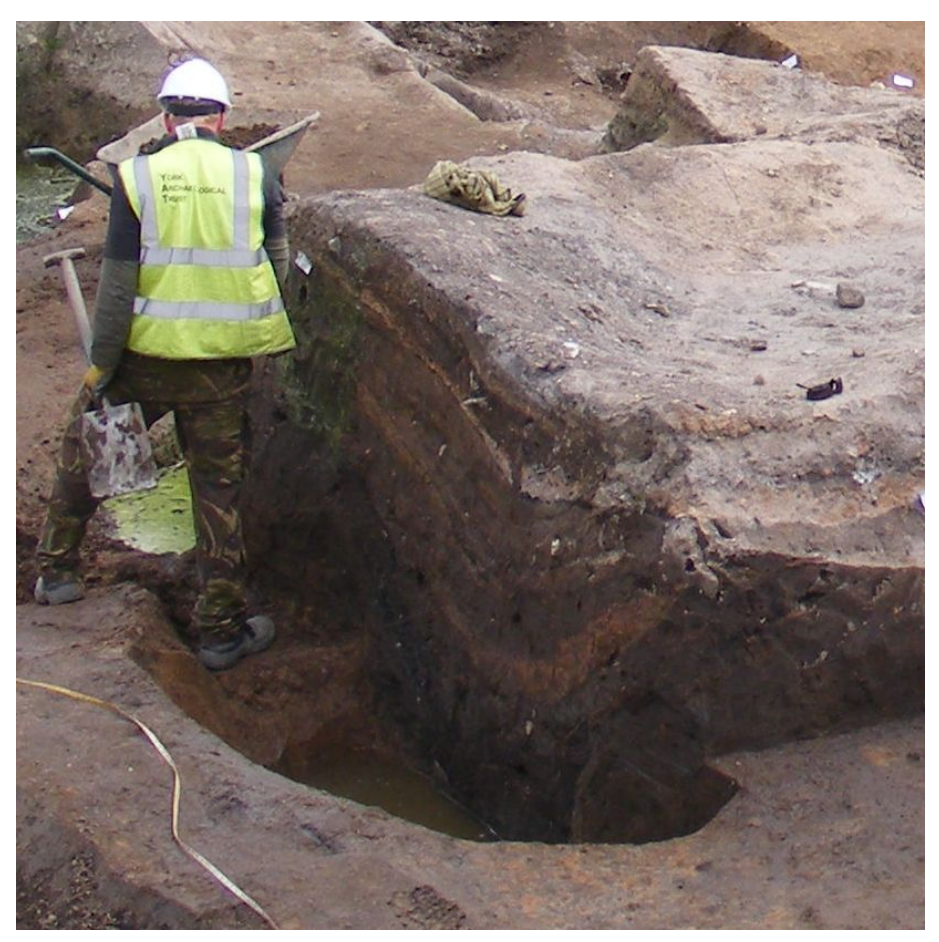
Figure 2: Distinctive early to mid' 10th century 'tiger stripes' slumping into an earlier cess pit

In the southern corner of the site there have been found Roman agricultural deposits and the site as a whole is dotted with Roman burials; both inhumation and cremation. Peter Connelly (Project Director), who was kind enough to speak to me about YAT's work at Hungate suggests that the landscape needs to be viewed from the perspective of those arriving in York from the river and that the sparsely used burial site on this marginal land would have been evocative from this viewpoint (pers. comm. 26th April 2010).