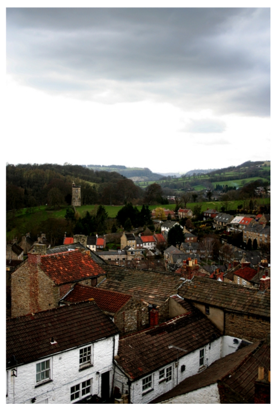
Figure 7. The view from the castle: Over Richmond and up Swaledale.