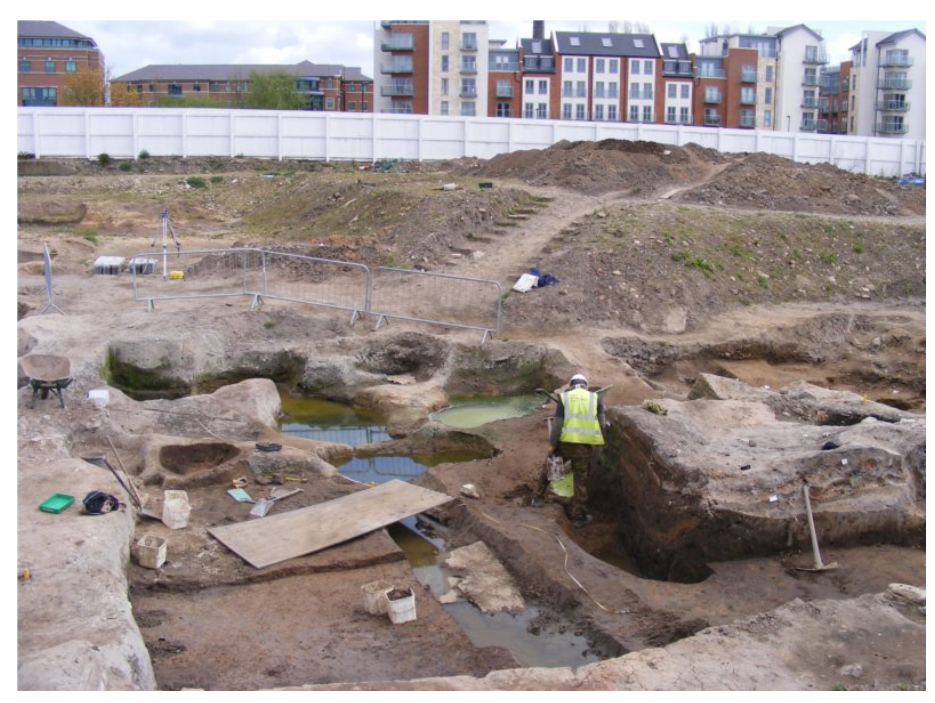
Figure 1: The remains of a late 10th century sunken building (left) and cess pits (right and rear)

The last buildings to occupy the Hungate site were warehouses with light industry and before that 19th century housing, demolished as part of the slum clearances of the 1930's (YAT n.d.). For those who have not visited the site on one of its popular Open Days or as a volunteer or placement worker, things are looking very different today. As a student in York I have been lucky enough to visit the site twice in my two and a half years here and so have been able to witness the changes going on, albeit in snap-shot style. On my most recent visit in April of this year I found the site much changed. The team have reached Anglo-Scandinavian layers and have unearthed numerous cess-pits, building plots and two sunken-featured buildings.