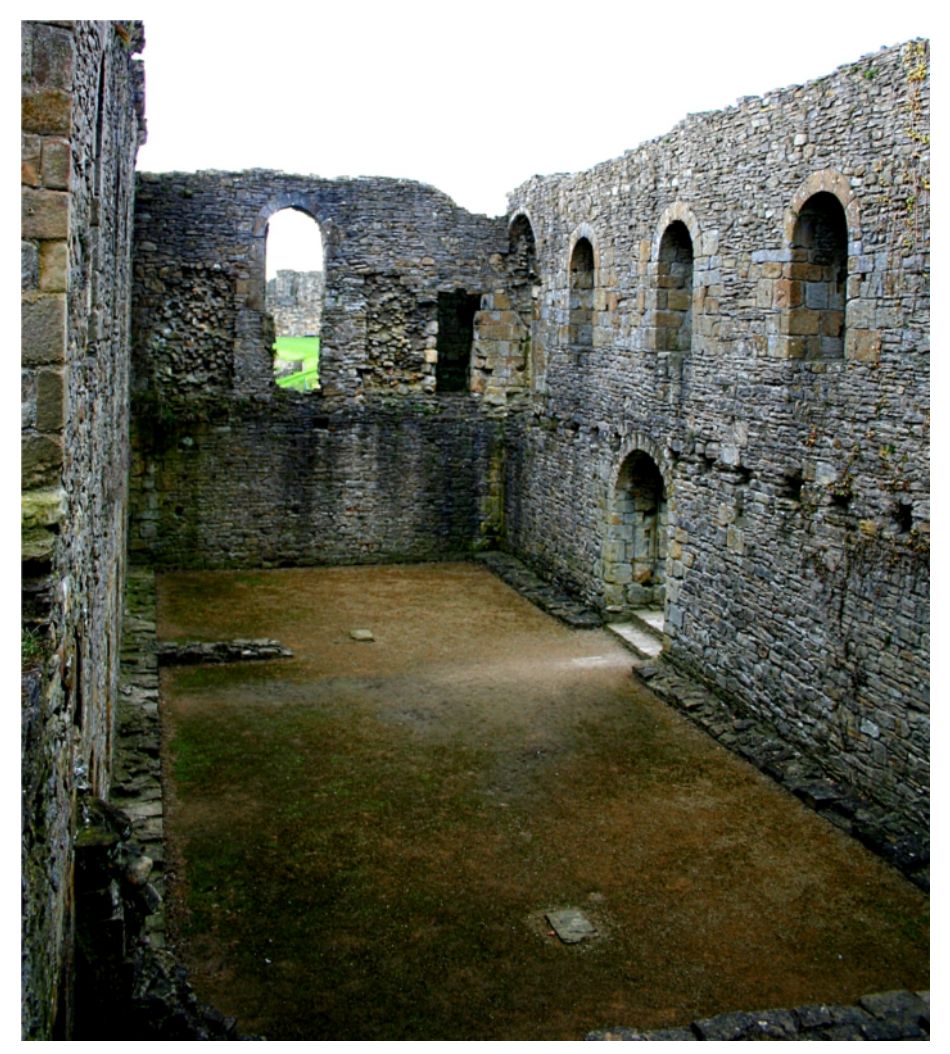
Figure 3. Scolland's Hall – Showing holes for the beams to support the first floor and large arched Norman windows

The Keep, as previously mentioned, was a 12th century addition to the older gatehouse with walls 11ft thick towering 100ft above the town. It consists of three floors; the basement, a lobby and some chambers on the first floor, and a great hall on the second. There is evidence to suggest that there could have been another floor above this as a few beam holes, possibly for beams, remain along one wall. The gabled roof of this top floor would still have been well below the battlements, which could be accessed through stairways within the walls themselves.