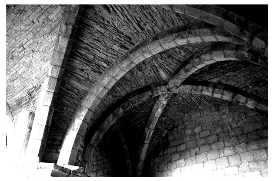
Figure 4. Vaulted ceiling in the basement

protection from fire, help support the rest of the keep and to help keep food cool. Around 1330, a ribbed vaulted roof, which can be seen in Fig. 4, was also added to the basement – an interesting sight for today's tourists who can once more gain entrance through the unblocked basement arch.