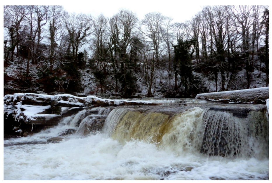
Figure 6. Richmond Fosse, right below the castle.

It was at this time that tourism became an important factor and the continuing popularity of the King's Head hotel is testament to this. With the newfound local and national wealth from trading abroad tourism became more popular and the historic features of Richmond, situated so close to one of the most beautiful areas in the country, made it a very desirable destination. One notable visitor to Richmond was the famous landscape painter William Turner (anon. 2004, n/a), drawn by the romantic ruins of the castle and the river with it's beautiful waterfalls (Fig. 6). His paintings of Richmond only served to further enhance it's popularity as a tourist destination over the following centuries.