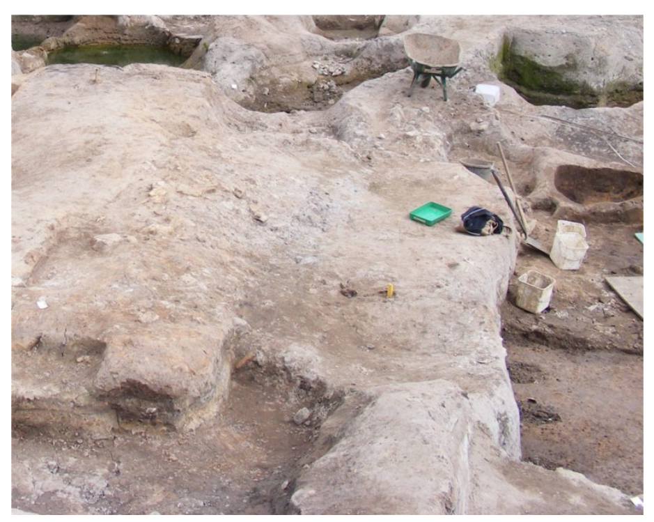
Figure 3: Remains of mid 10th century cobbled pathway which divided two plots of land