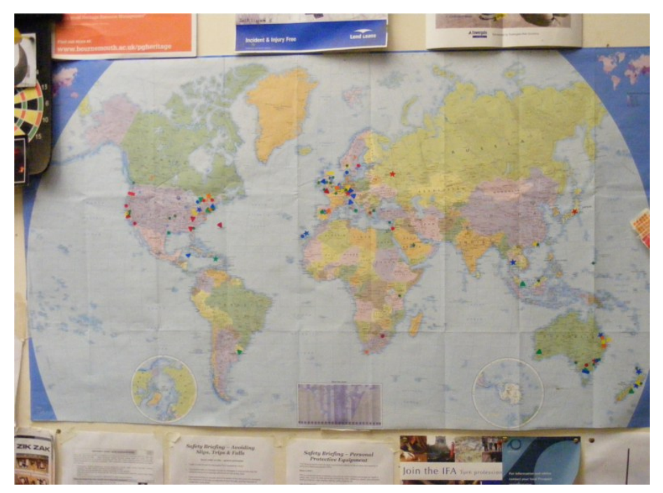
Figure 5: Map showing where Archaeology Live participants come from.

Archaeology Live is a paid-for training school which teaches a range of skills from digging techniques and finds work to site recording, environmental sample processing and specialist seminars. As one might expect to get a place you must book early. You can book for as long as you want (or can afford!) from 1 or 2 day tasters (£50 and £90 respectively) to two weeks (£325) or more! For more information email trainingdig@yorkat.co.uk.