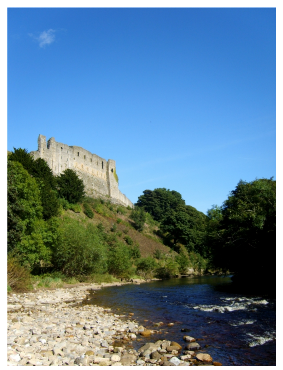
Figure 1. Southern Hill and River Swale