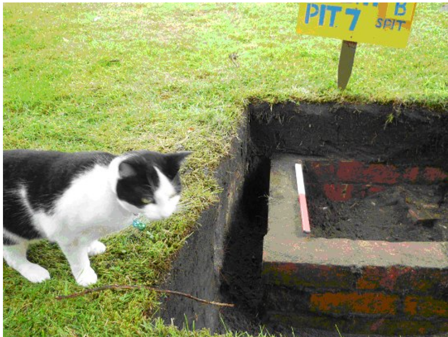
Figure 3 – All help gratefully accepted!

The weekend of the BVD arrived with ominous weather predictions of torrential rain. We again borrowed the gazebos and a large marquee we used for the Dig HQ. The local pub landlord put on sandwiches at lunch time both days. 13 test-pits were dug over the weekend, the most we could manage; two were on the village green, one in the pub garden and the rest in residents' gardens. The event also attracted a lot of schoolchildren whose newly found expertise was put to good use.