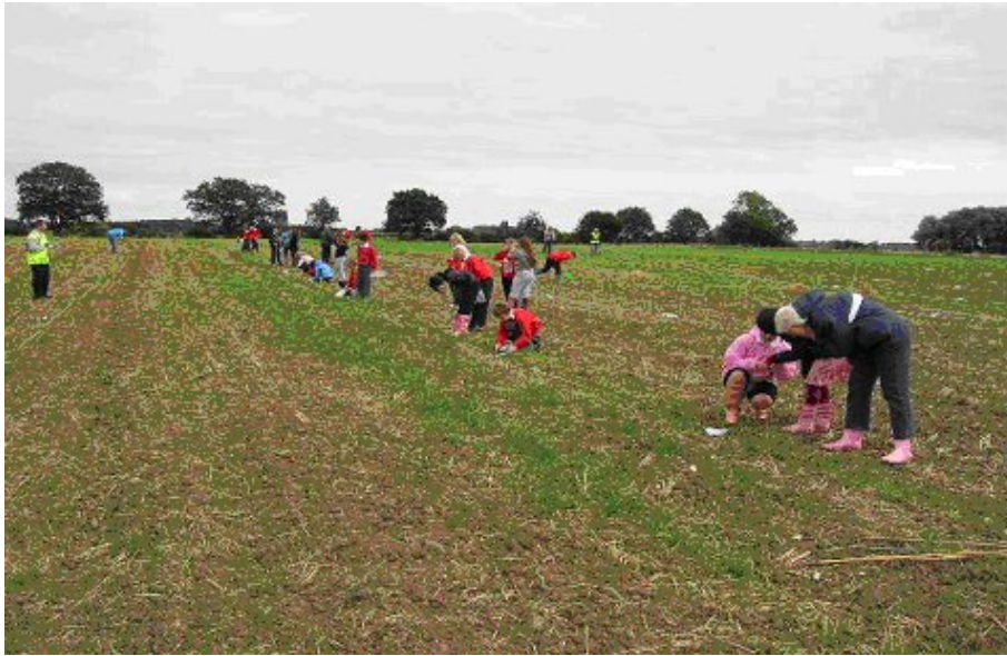
Figure 1 – Children from North Duffield school fieldwalking