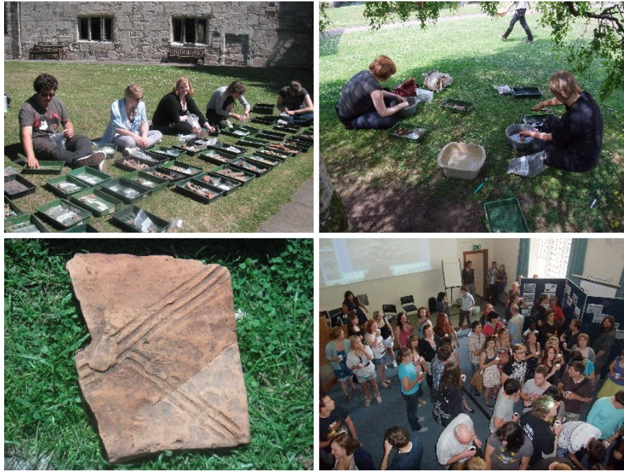
Figure 3 – Top Left and Right: Finds Washing, in the Sun and Shade – Bottom Left: Fancy Tile – Bottom Right: Exhibition!

11) This heralds the end of your first year, so enjoy the company, the sun (if there is any) and the free wine (in moderation) on Exhibition day, because you will miss it all over the long summer break.