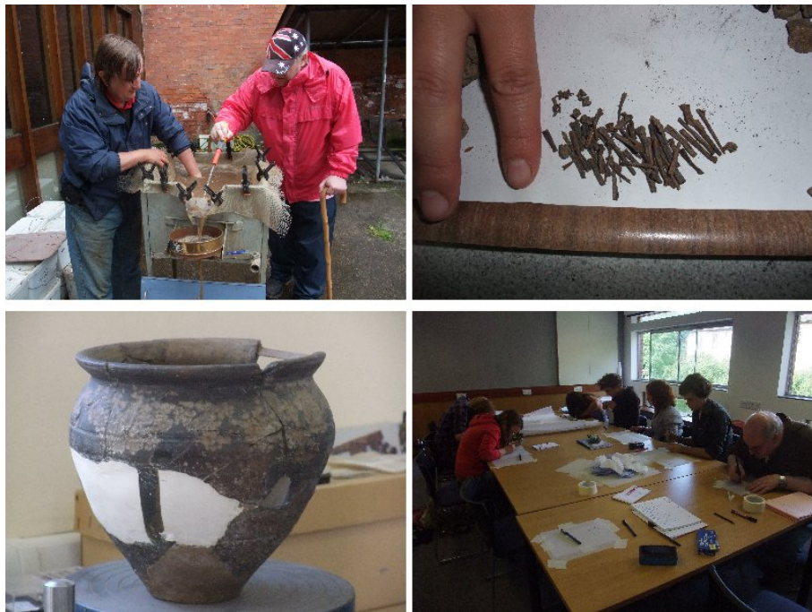
Figure 1 – The Joy of Post Ex – Top Left: Flotation (not as nice as it sounds) – Top Right: “Dem (Fish) Bones, Dem (Fish) Bones...” – Bottom Left: Restored Pot at YAT Conservation Labs – Bottom Right: Hard at Work on Excavation Records