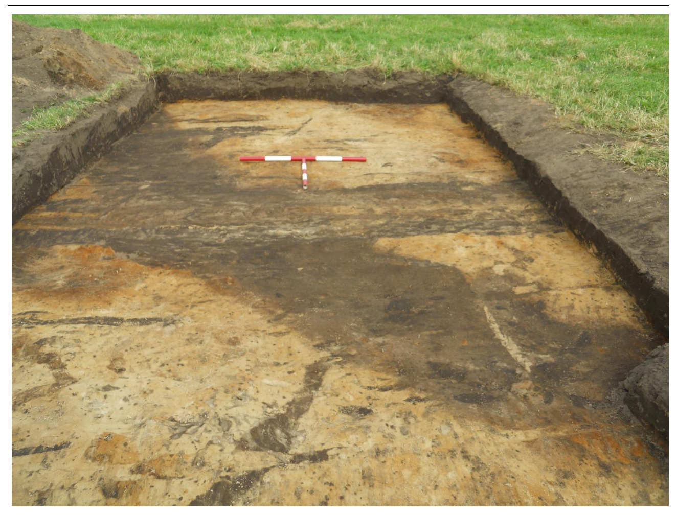
Ring ditch in Trench 2

Trench 3 failed to produce the unusual feature shown in the cropmarks, but a number of quite old, and modern, field-drains were investigated and further items of Iron Age pottery were recovered.