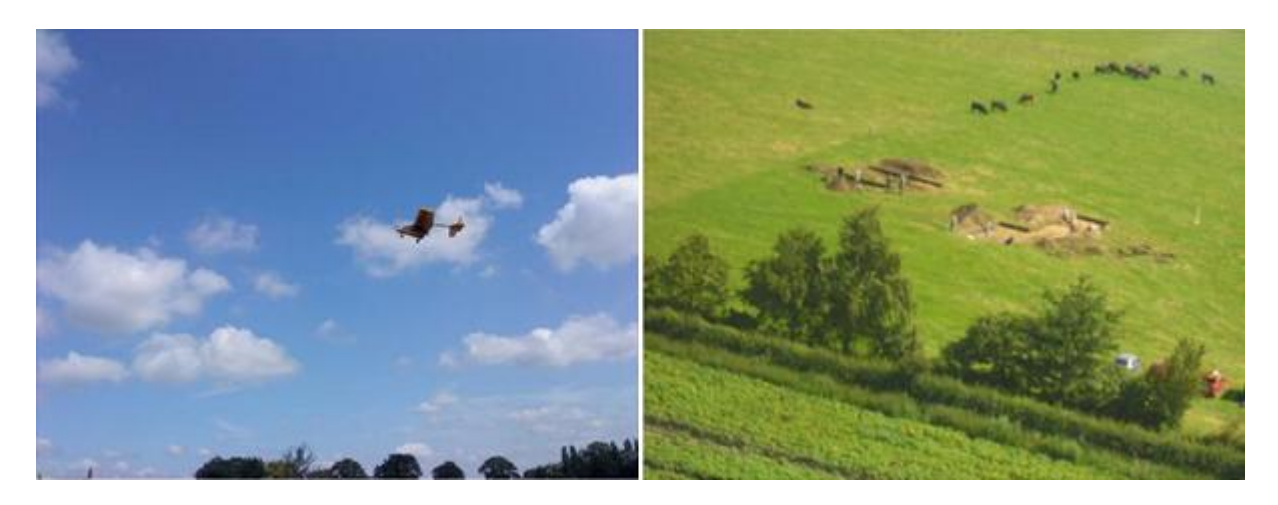
Aerial photography and view of the site

One of our members owns a plane and, at my request, flew over the site. He visited shortly afterwards with a request that he needed a light person with a good camera. Hannah was volunteered and agreed to go. Having swooped about the site taking pictures she returned an hour later with an ear-to-ear grin.