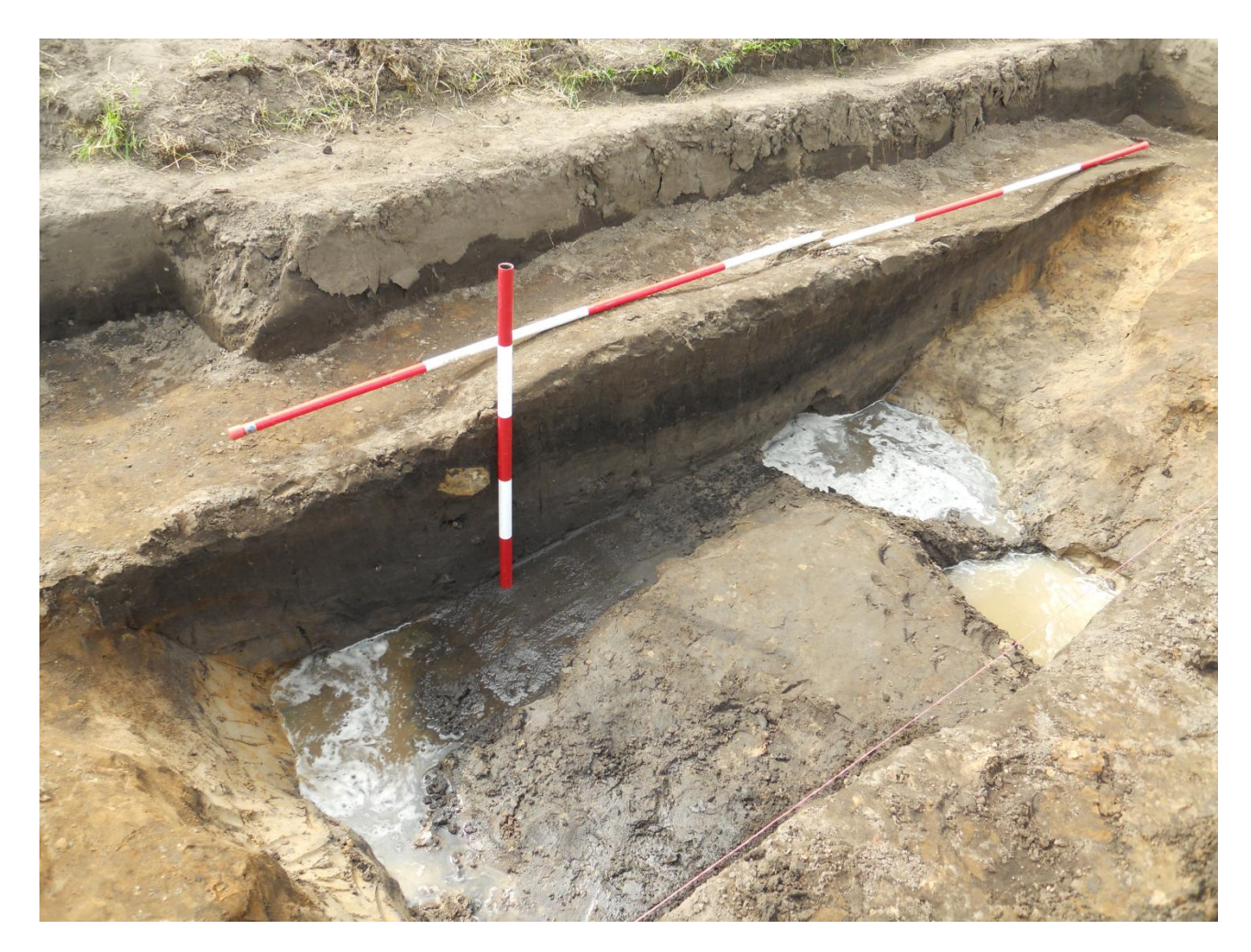
The ditch in Trench 1

We opened up three trenches. In Trench 1, after the plough-soil had been removed, indications of the linear ditch were immediately found. We were able to find the cut of the original ditch, albeit in a collapsed state, as well as some pottery, thought to be early Iron Age, and one rim sherd of what appears to be Roman grey ware. A ditch found in Trench 4, opened up to the West of trench 1, confirmed the continuity of the ditch and recovered further items of Iron Age pottery. Unfortunately, the ditch did what it was probably dug for in the first place, and rapidly accumulated water to a depth of twelve inches or so, precluding the excavation of the bottom of the ditch.