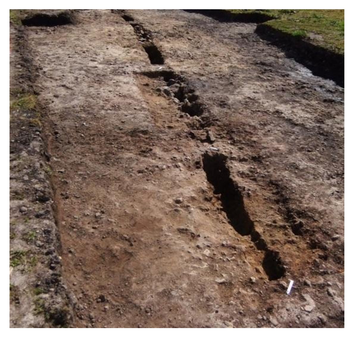
Intact sections of the palisade foundations in Trench AG

minor complication the palisade was successfully excavated, and by sheer chance uncovered a particularly interesting section, where there appeared to be three post pipes (these are holes that have a very precise form where the wood in the slot did not survive).