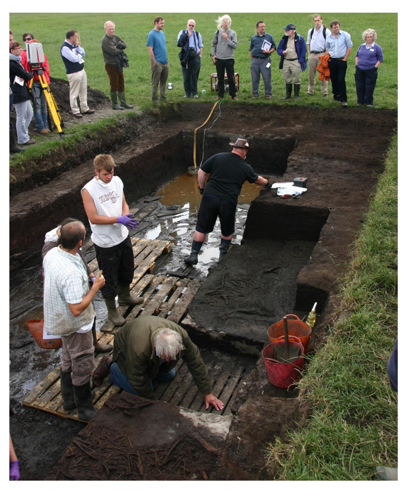
A site tour of Star Carr during the 2010 season of excavation