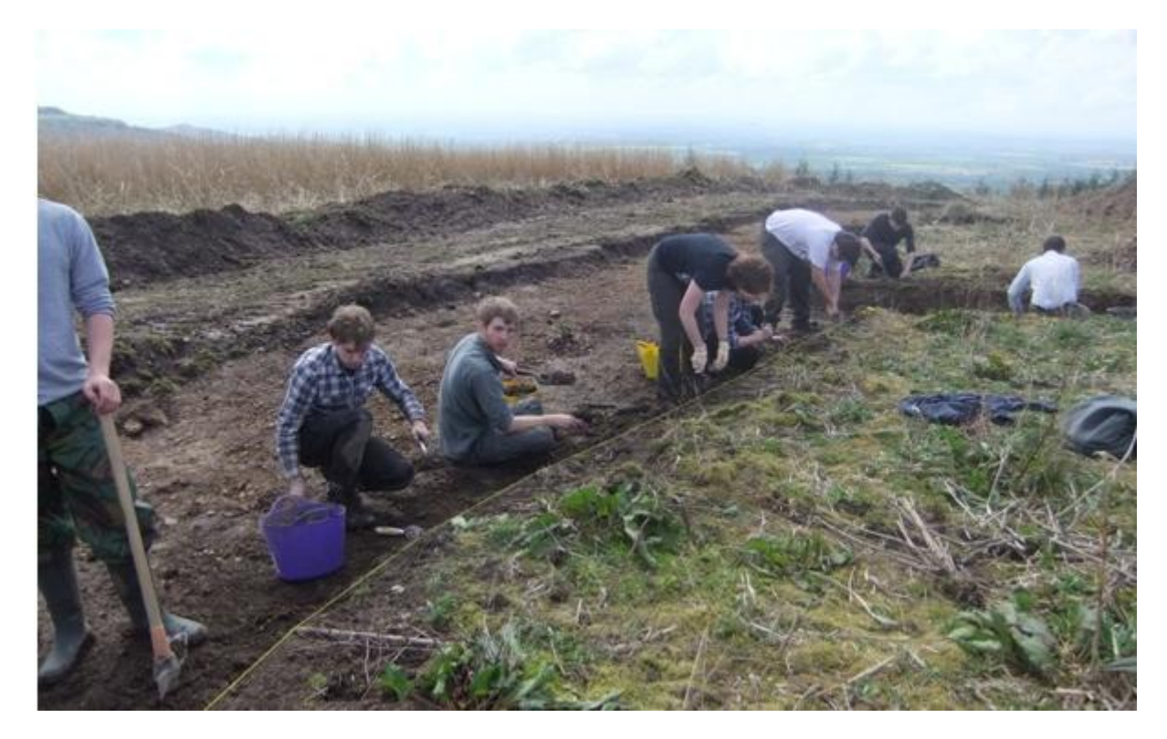
Some of the students at work in Trench AG (Used with kind permission of Barbara Grant)

Although that sounds like a simple task, what became clear very quickly was that the ability to trowel well is something that can only be obtained through experience. During this we heard many subjective phrases about 'the texture and colour of the soil' and 'the feel of the surface'. By the end of the three weeks we were also using these seemingly bizarre phrases ourselves! We worked on the clearing of the trenches for several days, something that became increasingly difficult with the steady deterioration of the weather.