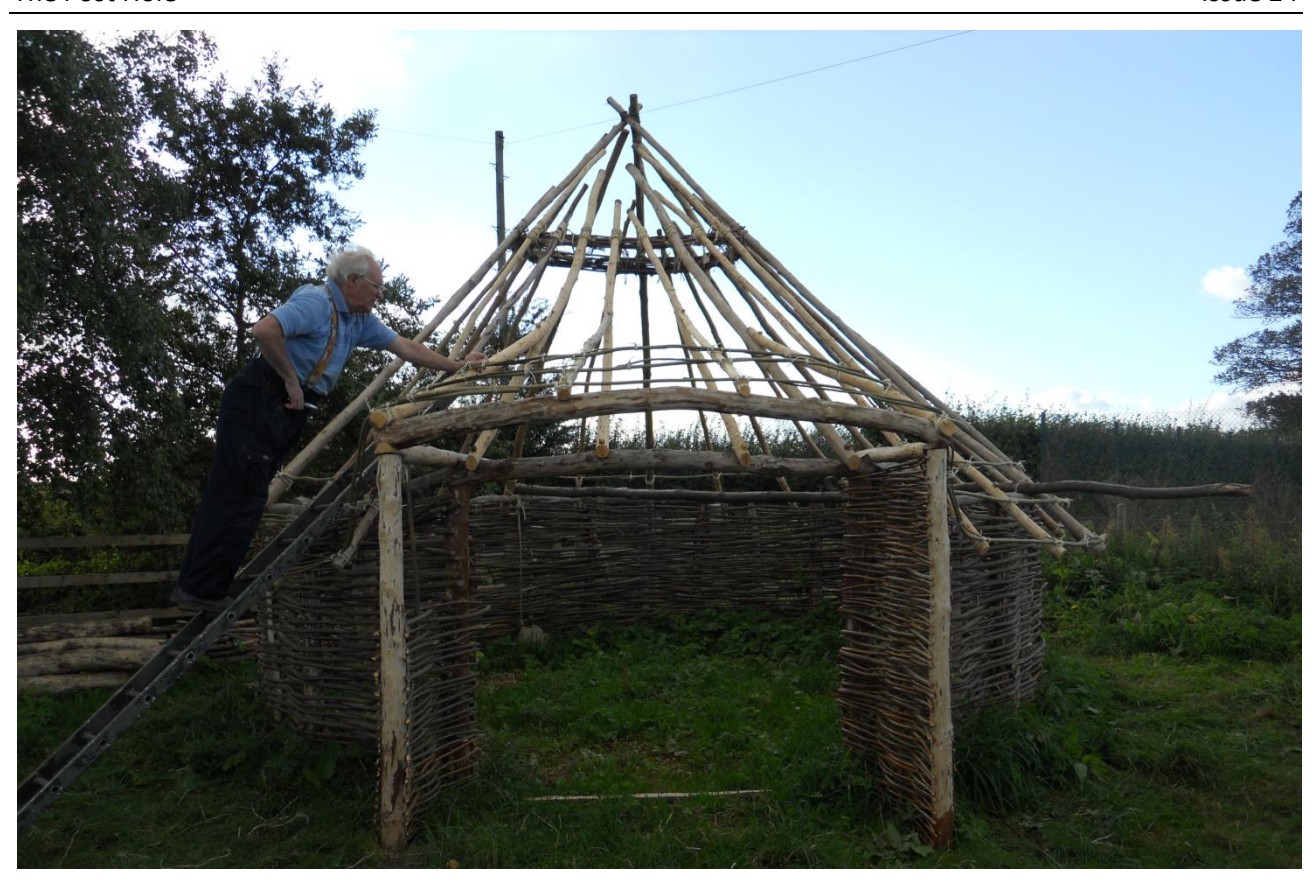
AND's reconstruction of an Iron Age round house in progress

In 2008, AND acquired the Vale of York Mapping Project transitions of cropmarks from English Heritage. This showed complex cropmarks to the North and West of the village as well as other smaller concentrations elsewhere.