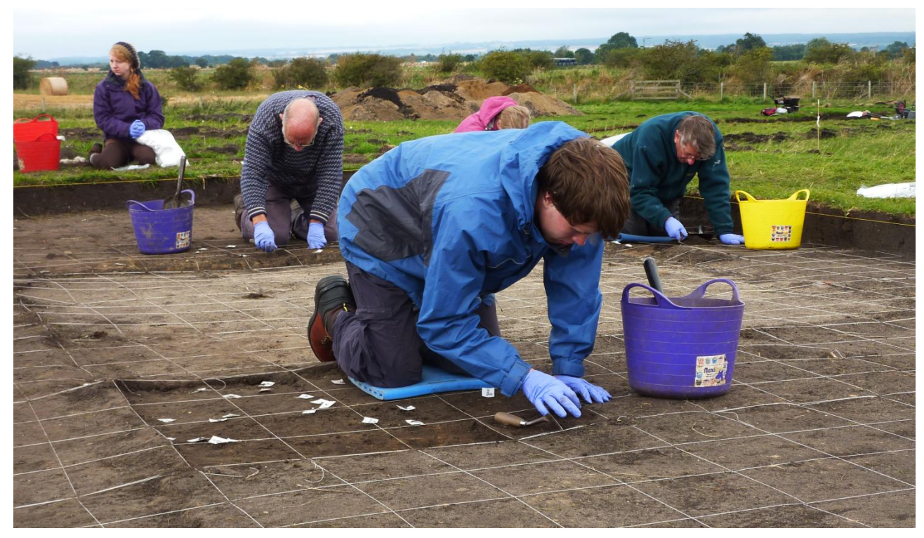
Sampling soil for chemical analyses at Flixton Island this summer

Thank you, yes it's fantastic! It basically funds a group of scientists to do further cutting-edge scientific research on finds and to do three or four more seasons of excavation. We have nearly twenty specialists, based both here in York and elsewhere who are leading experts in the country. So the money goes towards those people working on the Project and also the costs of doing scientific analyses.