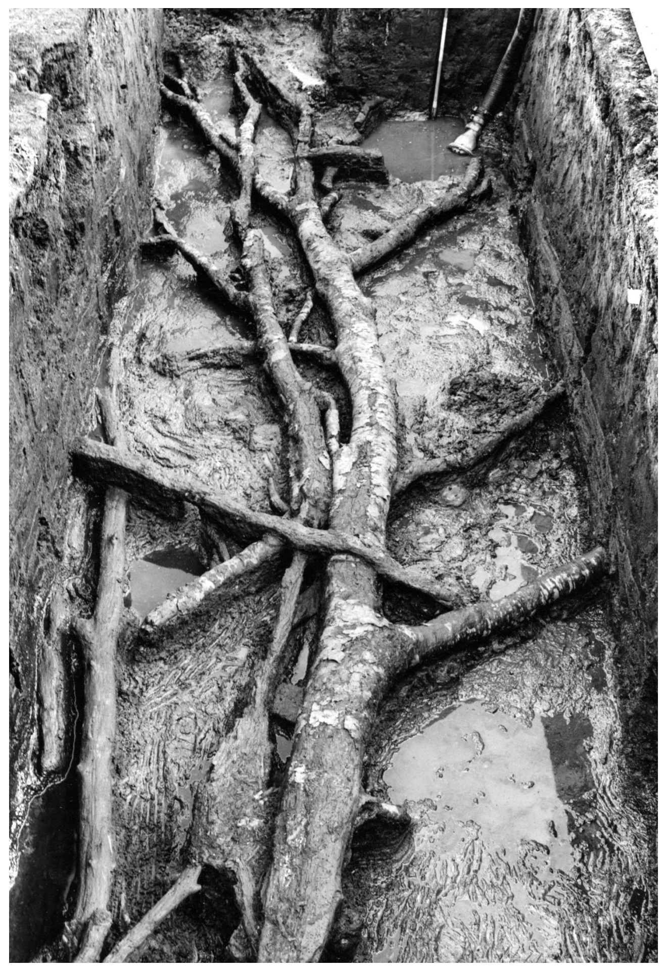
Birch tree excavated at Star Carr in 1950