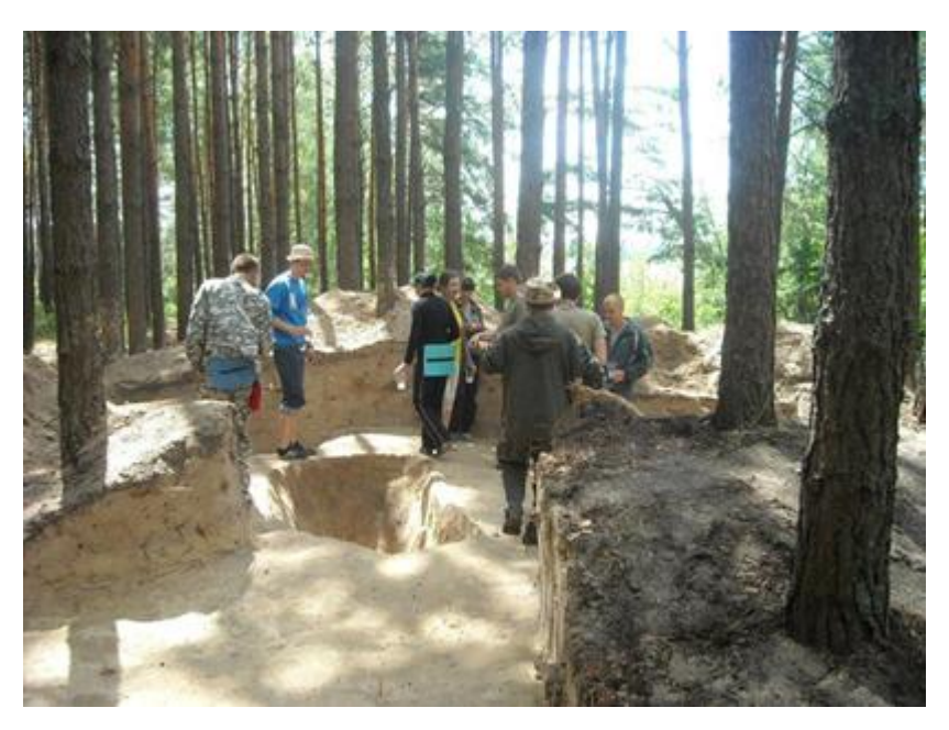
Figure 1: Position of trees around the trench

Here the archaeologist E. N. Osadchiy practises a different method. With twenty years of archaeological experience, he has come up with what seems to be the most practical approach to this regional problem.