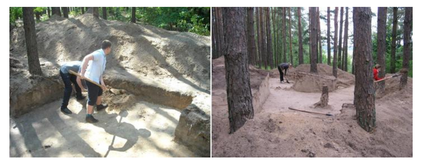
Figures 2 & 3: Shovels rather than trowels; unusual trench dimensions

As burials are placed either on top of the natural layer of just above it, the removal of top soil stops as soon as the natural or the top of the burial are visible. At this stage, the trench may be extended by the same method if the full extent of the burial is not within the excavated area.