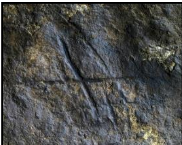
Figure 1: The Neanderthal "hashtag" (Rodríguez-Vidal et al. 2014, 13303).

Within scholarly literature, there is little evidence to suggest non-functional structures were habitually produced in the Middle Palaeolithic. The paucity of paleontological data is often misconstrued by archaeologists as proof that the Neanderthals were not capable of complex symbolic thought. However, recent excavations at Gorham's Cave in Gibraltar have revealed an ostensibly symbolic motif dating to 39 kya. The pattern, (Figure 1), which consists of "a deeply impressed cross-hatching carved into the bedrock of the cave" (Rodríguez-Vidal et al. 2014, 13301) contributes to contemporary narratives within archaeology that suggest the Neanderthals could conceptualise symbolic and ideological ideas. Nevertheless, the speculative nature of this interpretation signifies possible contention within Middle Palaeolithic studies. Rodríguez-Vidal et al. (2014) utilised experimental archaeology to challenge such scepticism and prove the markings were deliberately produced. It was revealed that "the number of strokes needed to carve the complete pattern ranged from 188 to 317" (Rodríguez-Vidal et al. 2014, 13305), indicating that the individual[s] had intended to leave a lasting impression on the cave wall. Furthermore, the quantity of strokes demonstrates that considerable time and skill went into producing the pattern, reinforcing its value to the creator[s]. The "engraving represents the first case in which an engraved