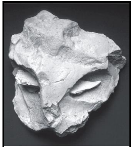
Figure 2. The proto-figurine “mask” (Marquet and Lorblanchet 2003, 664).