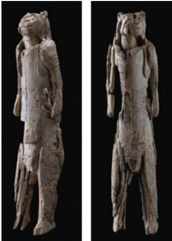
Figure 4: The 'lion-man' of Stadel Cave (Kind et al. 2014).