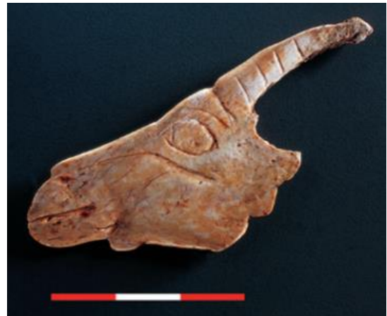
Figure 5: Bone ibex head from La Garma (Arias 2009).

In addition to its use in portable artworks, the figurative representation of animals also developed in the parietal art of the Upper Palaeolithic. Largely confined to the caves of southern France and northern Spain (Laming-Empeaire 1959), these enigmatic images, both painted and engraved, are some of the most outstanding in the prehistoric record. The animals depicted “rarely correspond to the preys killed and eaten on habitation sites” (Clottes 2013, 11). The species focus varies but mainly involves horse and bovids in the main galleries, with more