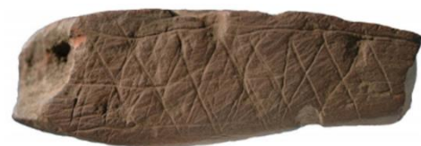
Figure 2: Engraved ochre from Blombos Cave (Henshilwood 2009).

at Fumane Cave in Italy, dated to 44 kya, indicate “the intentional removal of large feathers by Neanderthals” (Peresani et al. 2011, 3888). Complementing this, cut marks on eagle bones dated to ~50 kya at Rio Secco Cave in Italy and Mandrin Cave in France, indicate that eagle claws were deliberately detached from the feet. An “attractive hypothesis” here is the suspension and ornamental display of the claws, something seen in the ethnographic record (Romandini et al. 2014, 2). In addition to practices of ornamentation and pigment use, the earliest evidence for a tradition of abstract geometrical design comes from Blombos Cave in South Africa. Complex geometric engravings have been found on pieces of ochre in levels ranging from 100 to 75 kya (see Figure 2 ). Designs include cross-hatching, dendritic forms and right-angled juxtapositions (Henshilwood et