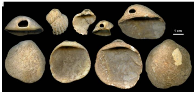
Figure 1: Neanderthal ornamentation from Cueva de los Aviones (Hoffmann et al. (2018a).

at Fumane Cave in Italy, dated to 44 kya, indicate “the intentional removal of large feathers by Neanderthals” (Peresani et al. 2011, 3888). Complementing this, cut marks on eagle bones dated to ~50 kya at Rio Secco Cave in Italy and Mandrin Cave in France, indicate that eagle claws were deliberately detached from the feet. An “attractive hypothesis” here is the suspension and ornamental display of the claws, something seen in the ethnographic record (Romandini et al. 2014, 2). In addition to practices of ornamentation and pigment use, the earliest evidence for a tradition of abstract geometrical design comes from Blombos Cave in South Africa. Complex geometric engravings have been found on pieces of ochre in levels ranging from 100 to 75 kya (see Figure 2 ). Designs include cross-hatching, dendritic forms and right-angled juxtapositions (Henshilwood et