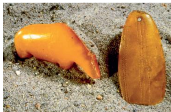
Figure 8: Amber bear and pendant found on Fano (Vang Petersen 2013).

Examples of figurative depictions include amber animal figurines from Scandinavia (Vang Petersen 2013; see Figure 8 ), an anthropomorphic figurine likely representing a wrapped corpse from Estonia (Jonucks 2016), and the Oleni Island figurines from Russia, which include therianthropic depictions and an unusual