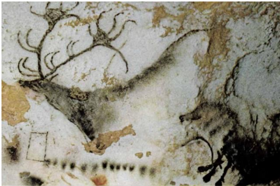
Figure 7: Red deer stag and abstract signs from Lascaux (Leroi-Gourhan 1968a).

Therianthrope figures appear rarely and are depicted in very simple fashion. No elements of landscape are depicted, and panels are often palimpsests of images with little concern shown for overlap (Laming-Emperaire 1959). The irregular cave walls, “far from hampering the artists, would seem to have guided and inspired them” (Laming-Emperaire 1959, 28), with many animals seeming to emerge from, or be constrained by, natural features of the rock. A number of