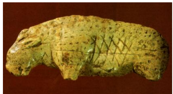
Figure 6: Aurignacian sculpture from Vogelherd (White 1989).