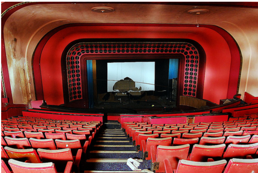
Figure 3 – Wakefield ABC cinema after 11 years closed.