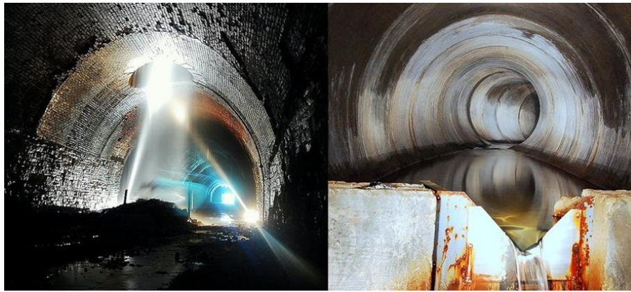
Left to right. Figure 5 – Spectacular image of water pouring down an old ventilation shaft in a disused mine. Figure 6 – Underground tunnel at Roundhay Park, Leeds.

The underground photos take a lot of practice. To photograph an entire railway tunnel 2 miles in length from end to end isn't very easy. They are pitch black places, and vast. To take a photo in these conditions, the society use a technique called 'painting with light'. This involves using a long exposure, a slow picture is taken over 20-30 seconds. A high powered search light is then used to 'paint' the tunnel. This creates an evenly lit picture, from what in reality is just a very large, very dark hole.