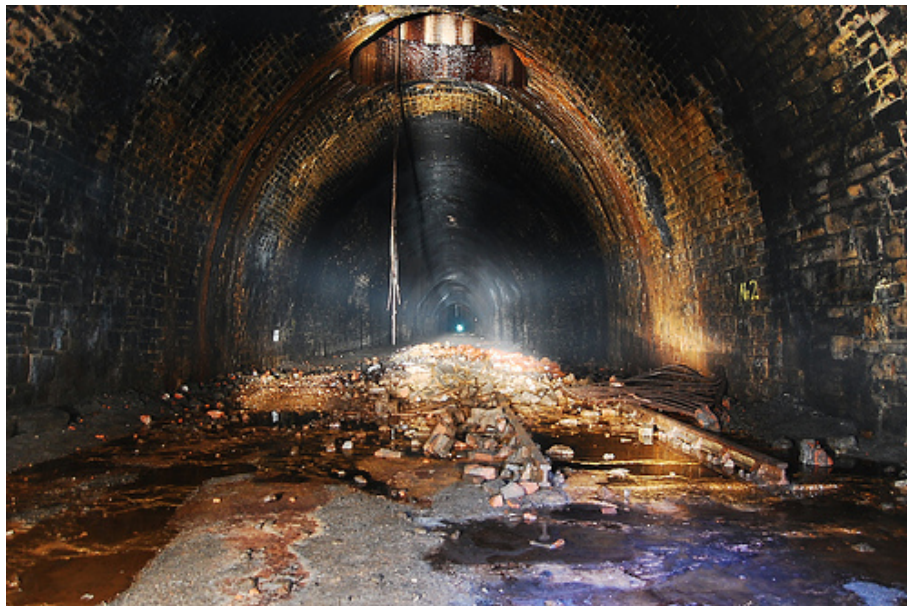
Figure 7 – Queensbury Tunnel, nr. Bradford.

The underground photos take a lot of practice. To photograph an entire railway tunnel 2 miles in length from end to end isn't very easy. They are pitch black places, and vast. To take a photo in these conditions, the society use a technique called 'painting with light'. This involves using a long exposure, a slow picture is taken over 20-30 seconds. A high powered search light is then used to 'paint' the tunnel. This creates an evenly lit picture, from what in reality is just a very large, very dark hole.