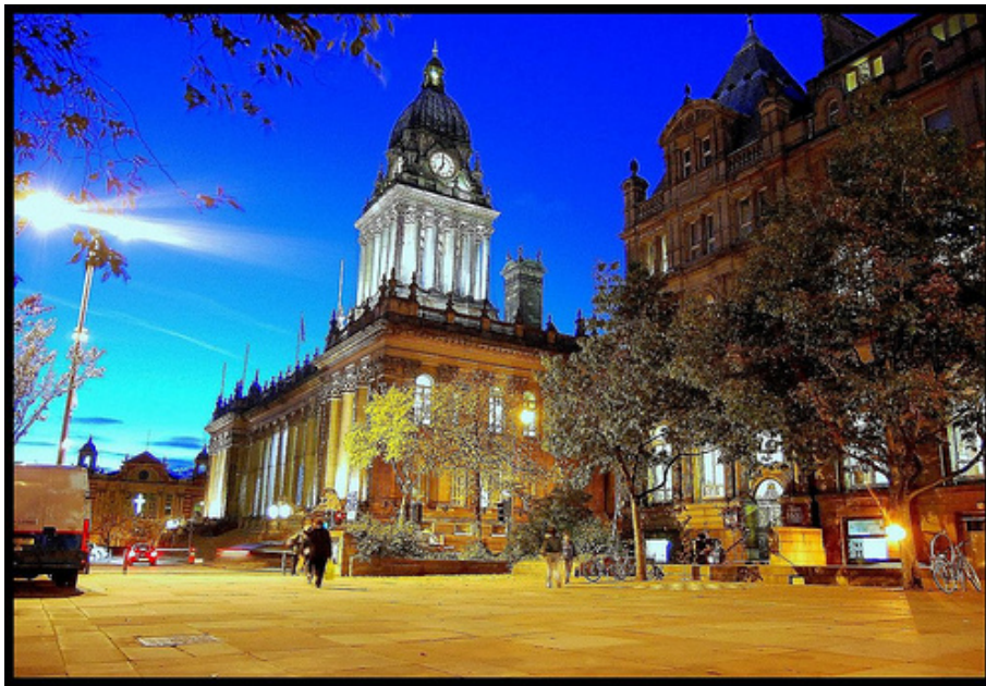
Figure 2 – Town Hall, Leeds.