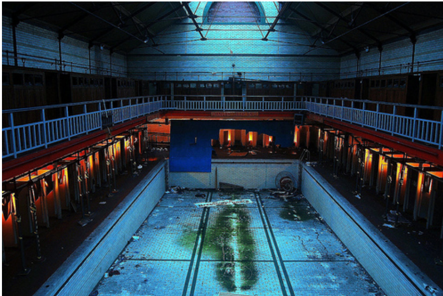
Figure 4 – Harphurhey Swimming Baths, Manchester.

Many of the locations they photograph were involved in the daily lives of previous generations that are within living memory. For one reason or another, they have fallen into disuse and then disrepair. Many beautiful buildings are left to ruin, whether by developers who need the land or simply by accident. As part of the inevitable evolution of a city, large sections of its cultural and historical past stand idle, waiting with baited breath for judgement to be passed on their future. The significance of these buildings exists only in the memory of an aging generation.